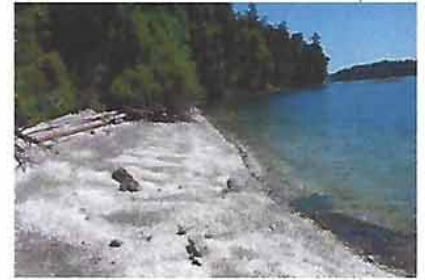
Sit beside the seaside in early Spring...a gift!

its mutant strains, the hesitations in vaccinations, with the provincial government's continued emphasis re stay home, keep to one's bubble, only essential travel encouraged, the seasonal shift is bringing with it a reminder that there is always light at the end of the tunnel. Even early Spring brings with it that sense of ease that light and warmth on sunny days always delivers. Tucked in between the early Spring promise, though, we can still get Arctic Front intrusions, sometimes snow, sometimes just that "Alberta Day" cold. The charm, though, is that these frigid repercussions don't last long. Longer days show us the way to real Spring. We all have special