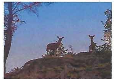
Curiosity...the route to imagineering....

Round Salt Spring Sailing Race, etc etc etc...all on hold. No one can say when it will all be back "on". Groups have tried to do online/virtual gatherings, as a way to keep the enterprise in the public mind. And what about online shopping? The mantra to Shop Local is a part of all small communities, but it's difficult to be up against ease of purchase, with large volume price abilities. Hmm... After awhile, one forgets the old as the new takes full control. It seems all communities are now asking for input on how to evolve their community plans...Salt Spring, too. Your thoughts are?