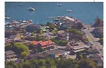
A bird's eye view brings understanding.

date. A seller sees all offers at the same time & decides. If there are 12 to 16 offers (not impossible in an entry level priced property), then there will be 11 to 15 disappointed parties. Choice is out the window, as far as desire for a specific property description. We are in a true sellers market. Buyers buy whatever.