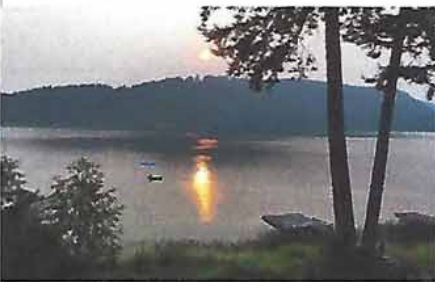
Water...it's about reflections...

Early Spring is a great time to be a visitor on one's own Island. Salt Springers need to remember all the great places enjoyed when first arriving: Ruckle Park, Fernwood Dock/beach, Vesuvius Beach, Drummond Children's Park, Mt Maxwell Park, Mt Erskine