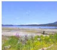
Meander into Summer...

will entertain financing, on excellent terms. Ask me for details on this. Your own private hiking/walking trails, & adjacent to hundreds of acres of a further park trail network, this serenely private area is waiting for you. A WOW! And, it's on Salt Spring Island!