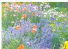
Afternoon tea in the garden? I'm in!

Have enjoyed the experience of being the Salt Spring Chamber's president during 2013/14. I certainly learned a lot. It's important in this non-municipal & Islands Trust locale that everyone in business belong to the local Chamber.