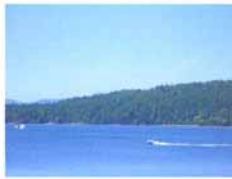
Catch the vibe...it's Summer in the Islands!

Street shops, Munro's Bookstore, the B.C. Museum, Robert Bateman's gallery in the former CPR building in the Inner Harbour. The Parliament buildings, the Empress Hotel (high tea?), Beacon Hill Park. Cowichan Valley offers Cowichan Bay,