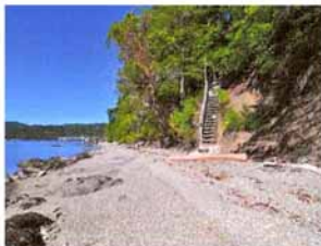
The beach knows your name...

as it's important in this slow recovery of our real estate market to be "everywhere", on behalf of the sellers. Our retail merchants in Ganges Village continue to surprise & entertain their customers with great inventory & specials...in a time of online shopping. That personal touch is evident everywhere, in every business. Websites, social media, online commerce...we are all con-