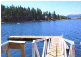
Your kayak awaits...Chocolate Island ahead?

lo's, & Auntie Pesto's. Farm to plate? Harbour House Hotel. Vineyard tastings: Garry Oak Vineyard, Salt Spring Vineyard, & Mistaken Identity. Award winning local wines! Off to the cheese-makers: Salt Spring Cheese & Moonstruck Cheese. Farmgate produce, Saturday, Tuesday, & Wednesday Markets, studio tours, gallery openings, al fresco dining options (Golf Course deck,