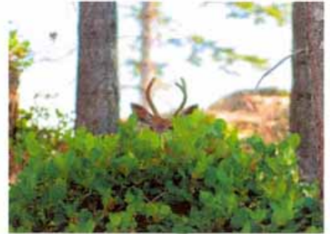
Deer, birds...seals, whales...a bountiful natural world.

mental beauties of the Gulf Islands. More info? Call me. Information is important, always! Interested in owning/starting a business? Opportunity here...call me! 250-537-7647