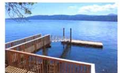
In the heart of the best protected boating waters in the world!

watching, fishing, an abundance of marine & bird life. An inspiring natural beauty that restores & invigorates. Give yourself a gift...visit Salt Spring soon! Call me!