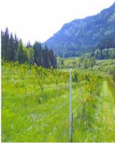
Arts, agriculture, alternative wellness op-