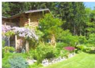
Arable opportunities...microclimate here!

Sometimes people look a little surprised when I suggest this. Although all the Gulf Islands (southern, mid, northern) are nestled into the east side of the much larger Vancouver Island,