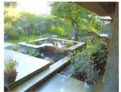
Discover yourself on Salt Spring & the Southern Gulf Islands...just "be".

are few listings & lots of buyers. This ends with price stabilization & then price increases. It may take until this time in 2017 to see a sellers market in all price points/property types, but in residential up to 750,000, it is clearly already a sellers market. Affordable raw land is quickly selling off. Commercial opportunities are just now starting to get inquiries. All of